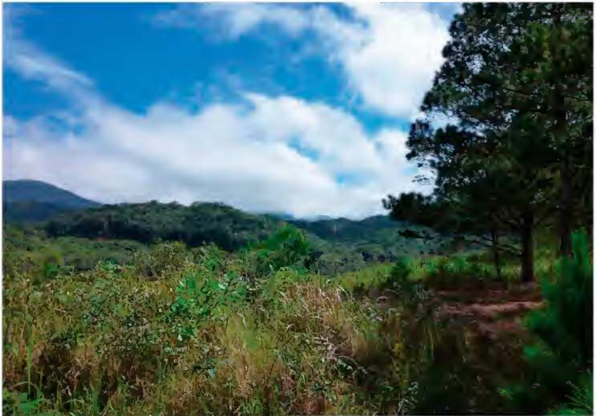
Figure 1: General view of natural community, in which Nepenthes smilesii was found in Bi Doup – Nui Ba National Park (South Vietnam).